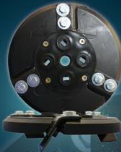
CONCRETE FLOOR RESURFACE TOOL