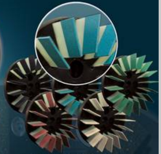
CONCRETE FLOOR SHINE SYSTEM