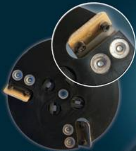
WOOD FLOOR SANDING TOOL

For great results, use DIAMABRUSH® POWERED BY ONFLOOR TECHNOLOGY